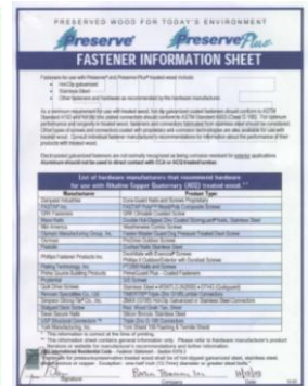
Testing in 2003