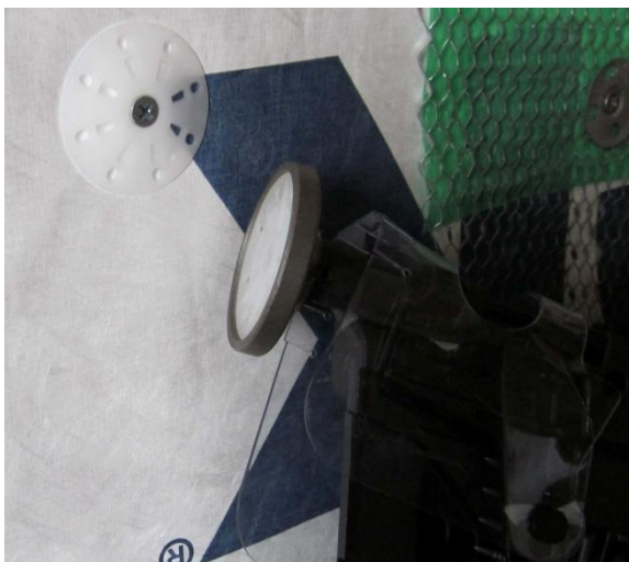
1¾" dia. Plasti-Grip® CBW on Tyvek®

Ballistic NailScrews® can be used with Plasti-Grip® CBW (1¾" dia.) or CBW2 (2" dia.) washer fasteners for Building Wrap or Air/Vapor barrier applications such as Tyvek®, Typar®, and Pactiv®. Nose adaptors are available for specific UFO tools which hold the washer in place for rapid installation.