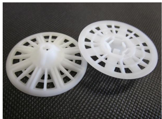
2" dia. Plasti-Grip® PBLP2