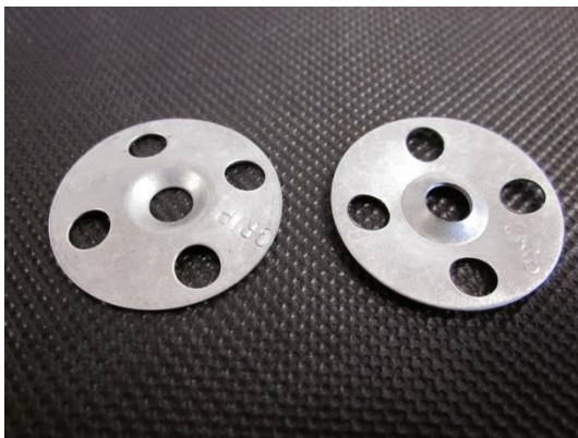
1 1/4" dia. Grip-Plate® Lath Washer