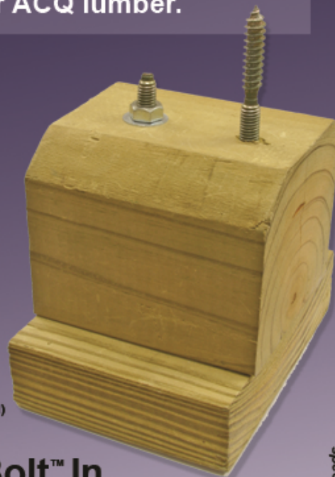
Star Head (T40 bit included)